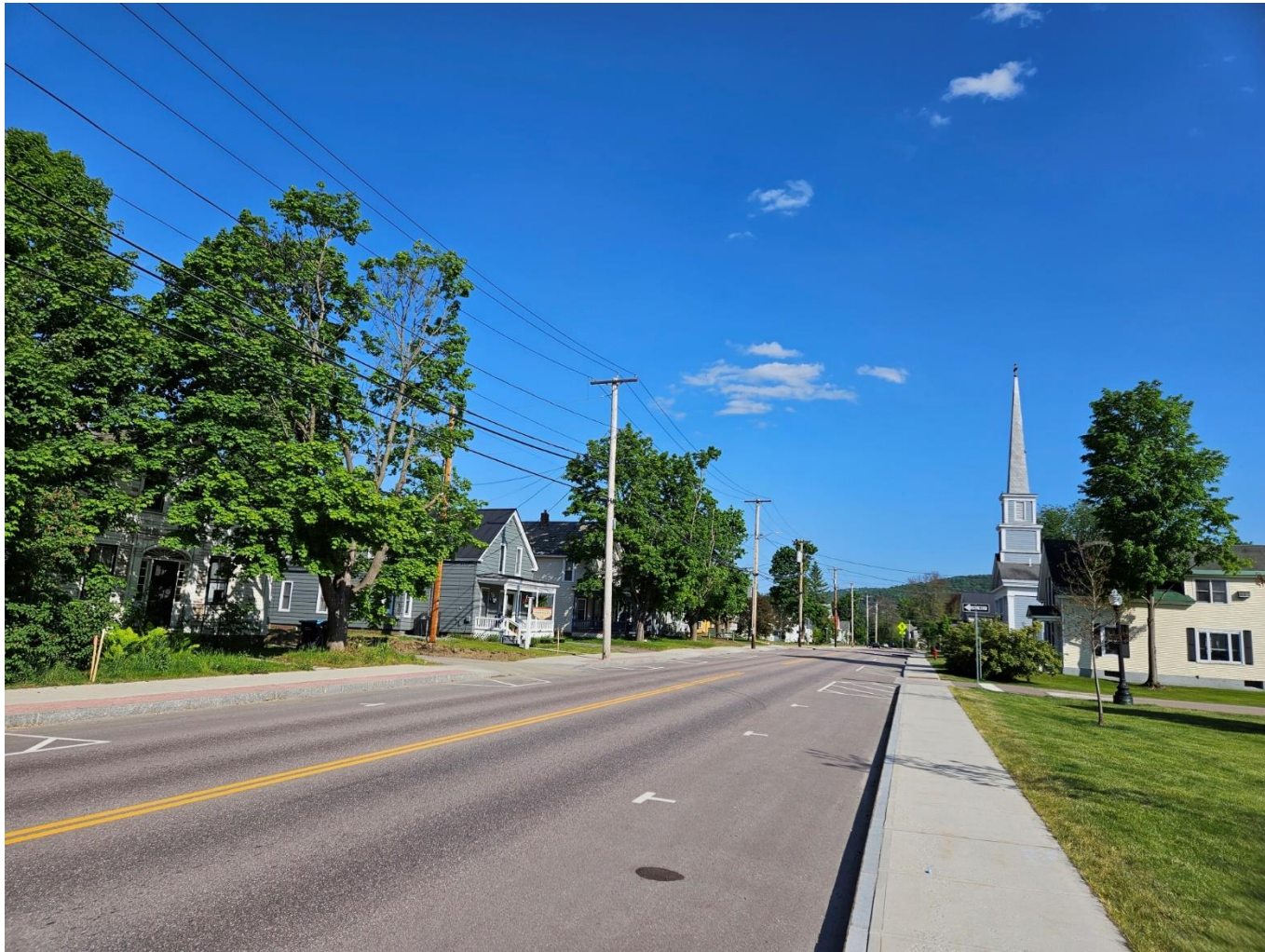
South Main St. with 102 & 104 on the left and St. Andrews Catholic Church on the right