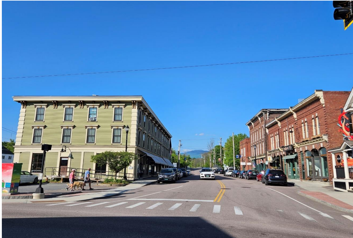
Stowe St. & Main St. today with restored Stimson-Graves Bldg. with senior housing, Waterbury Senior Center, and retail space