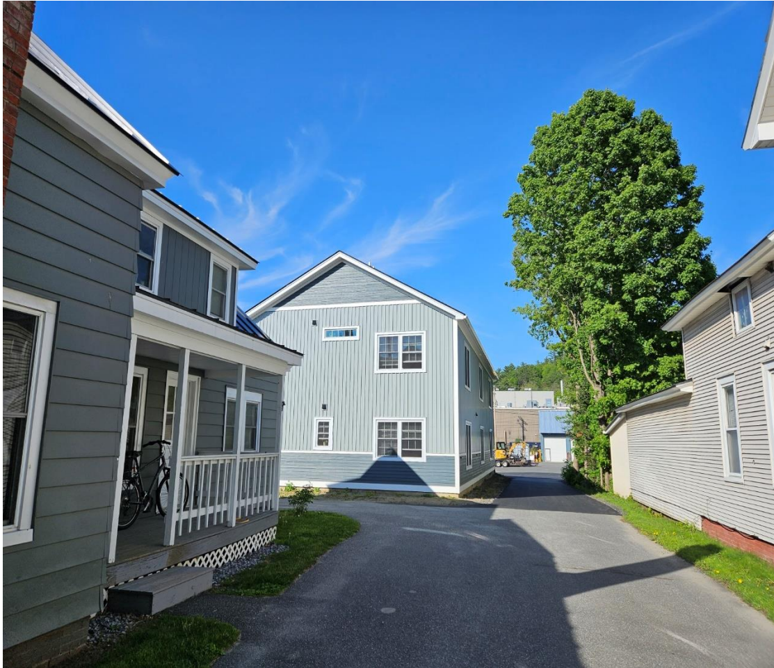
104 S. Main St. with three-unit building that replaced a deteriorated carriage barn.