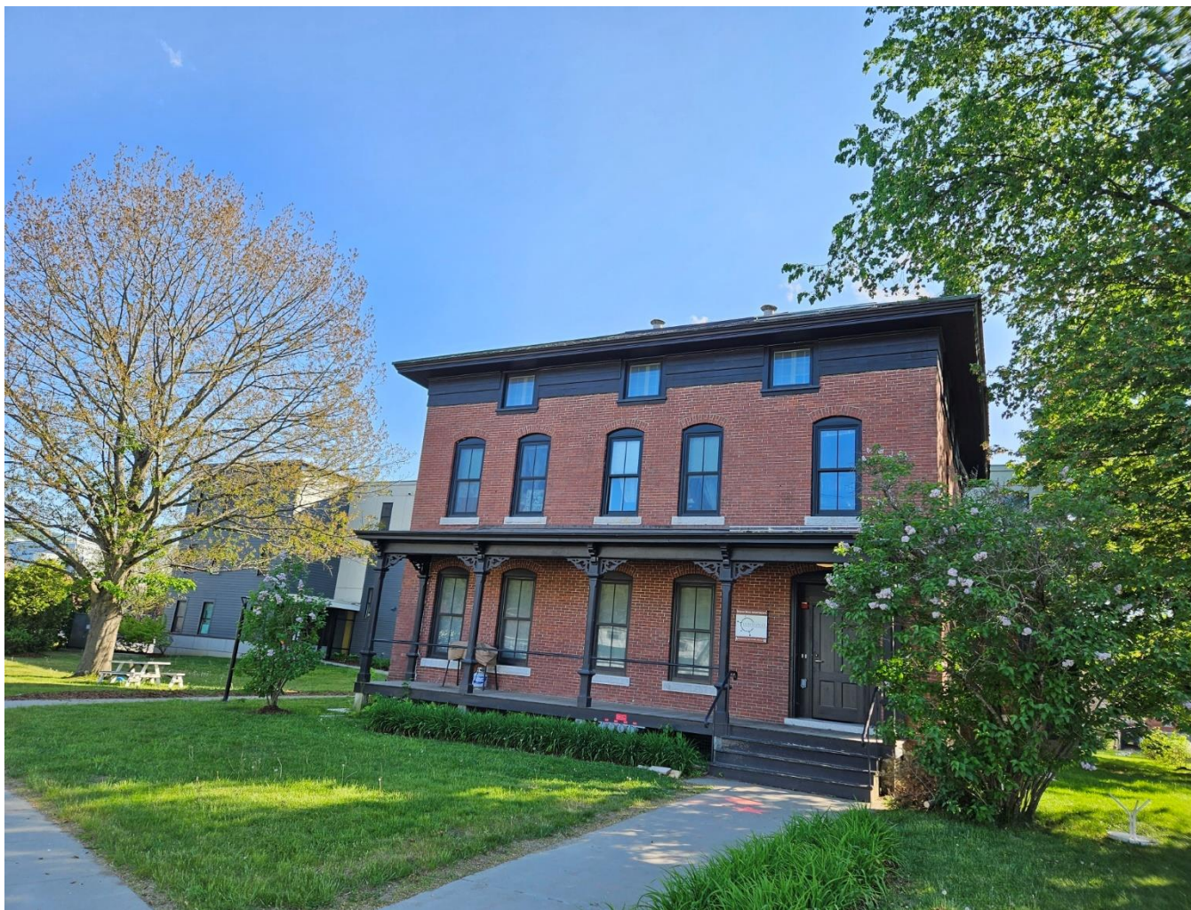
Main St. Apartments developed, owned and managed by Downstreet Housing & Comm. Dev.