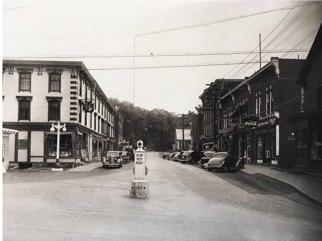
Stowe St. & Main St. in 1930's with Stimson-Graves Building on left - historic mixed use