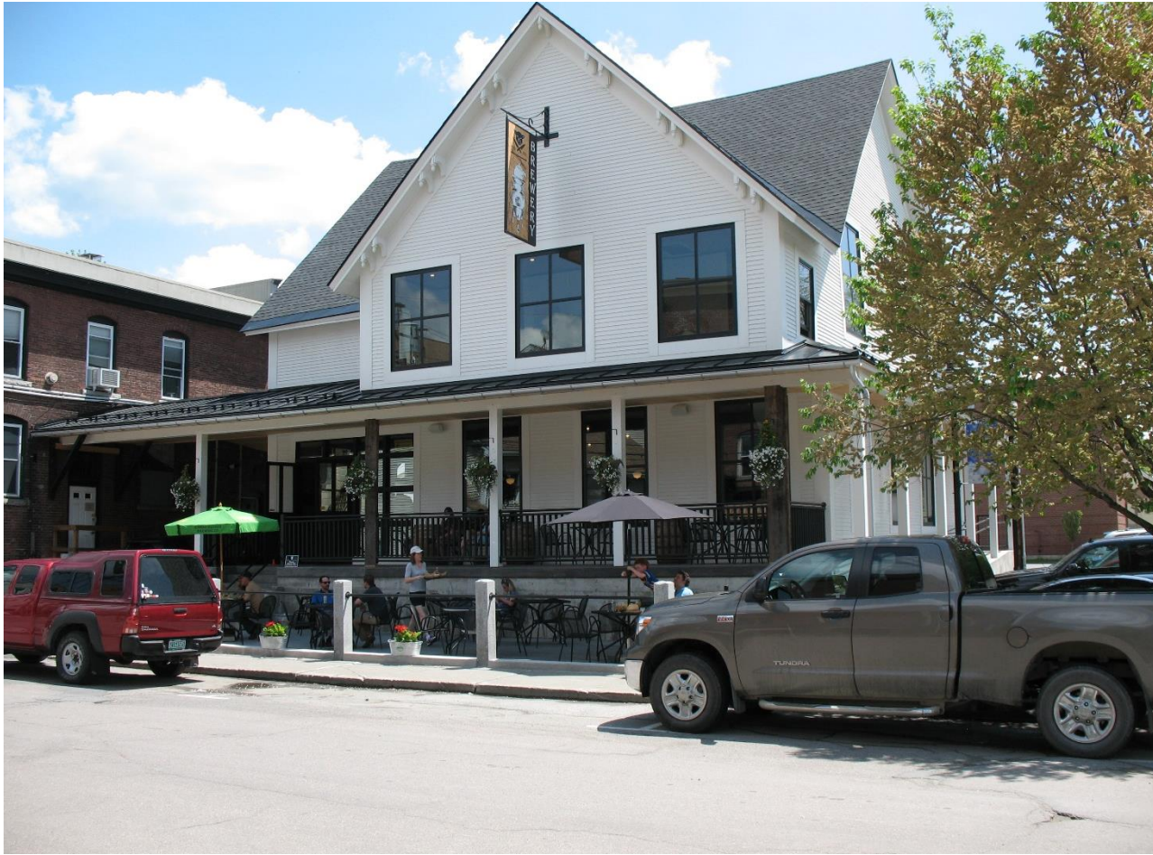
This is the Prohibition Pig brew-pub on Elm St. with outdoor dining on the sidewalk level.