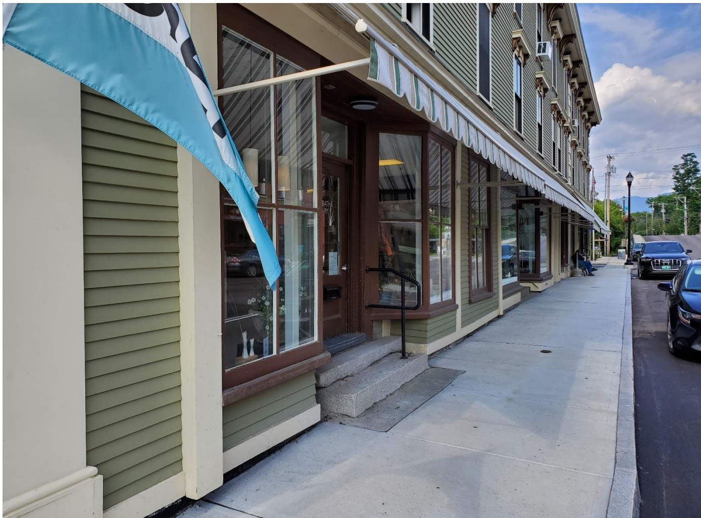
Axel's Frame Shop and Gallery at the Stimson- Graves Building – renovated with a new sidewalk.