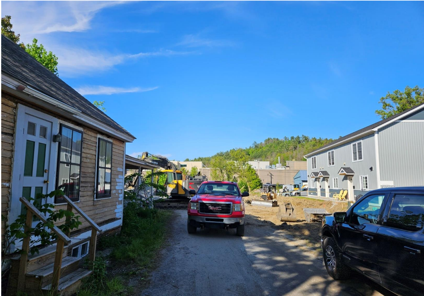
102 S. Main St. with seven-unit multi-family addition under construction