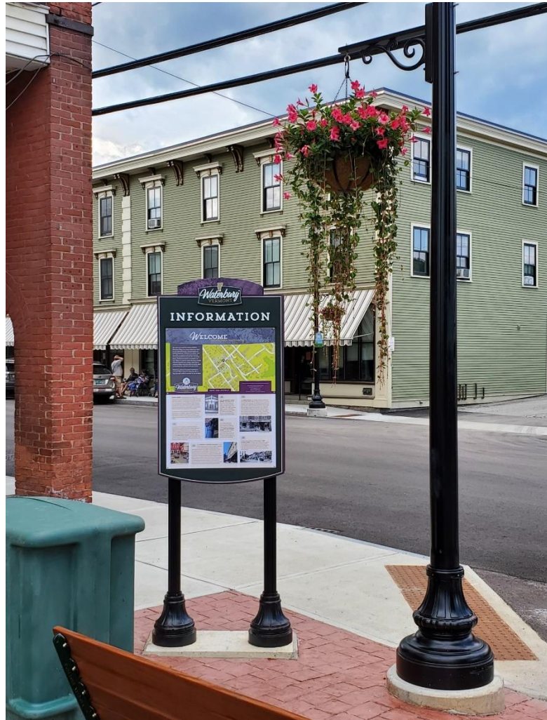
Streetscape with wayfinding & amenities with Stimson-Graves Bldg. – Senior Center on 1 st floor