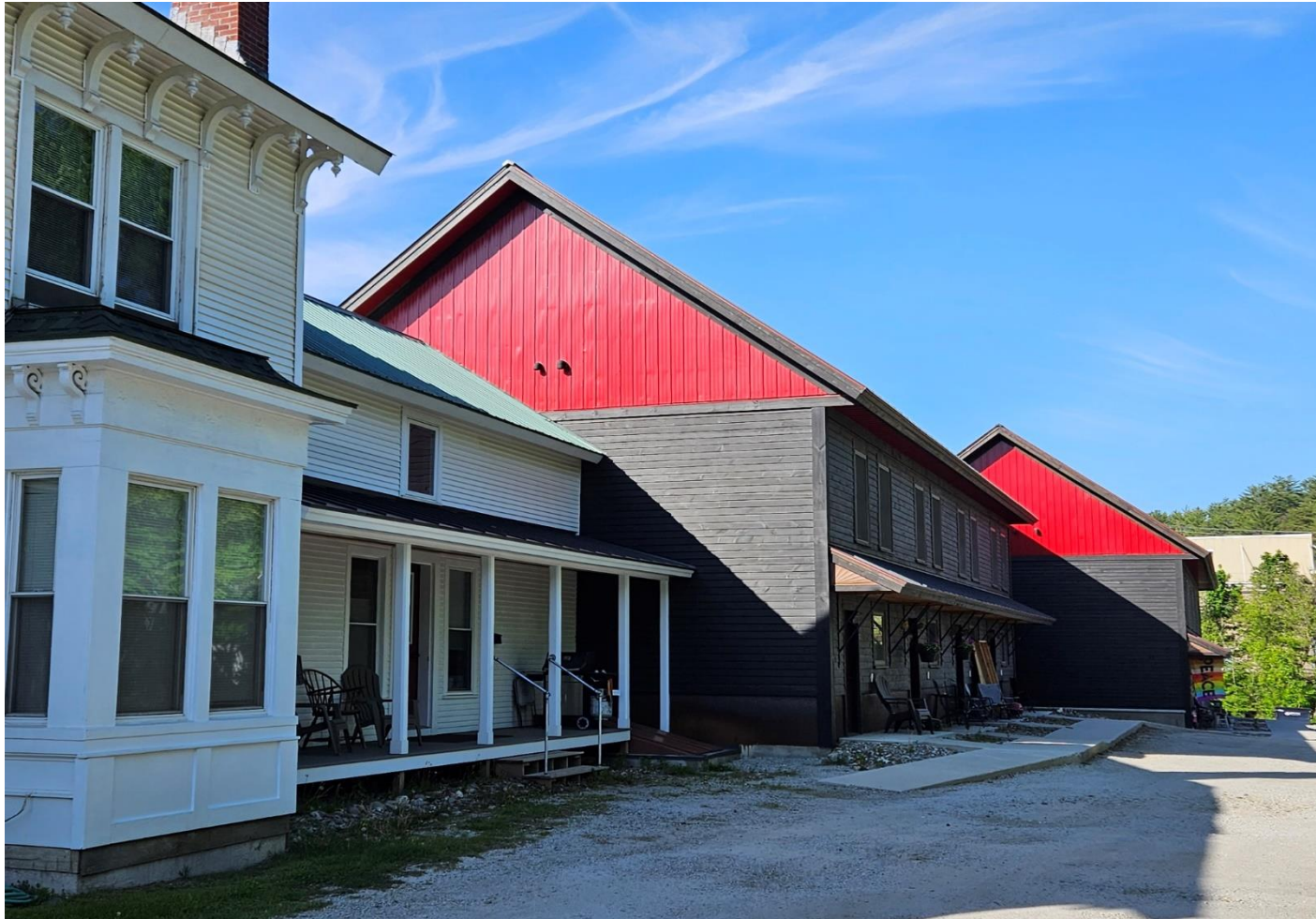
100 S. Main St. with eight-unit multi-family addition