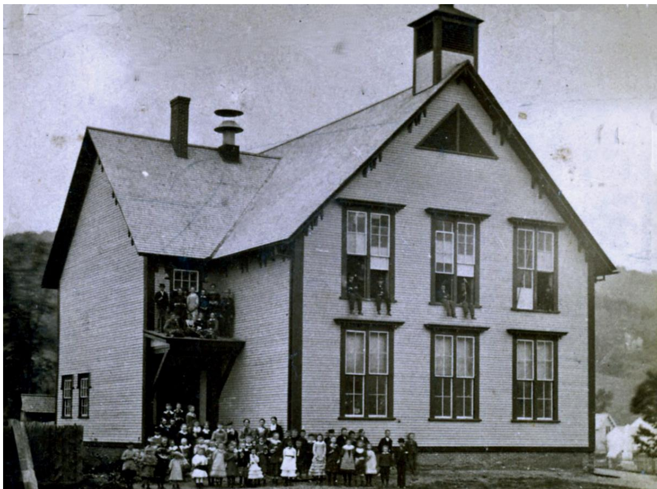
Village of Waterbury graded school circa 1900. The building was moved from N. Main to Elm St.